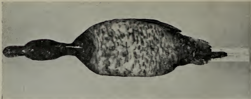
Variant first winter female Tufted Duck; 5. xii. 1960, showing heavy brown flecking of the underparts.